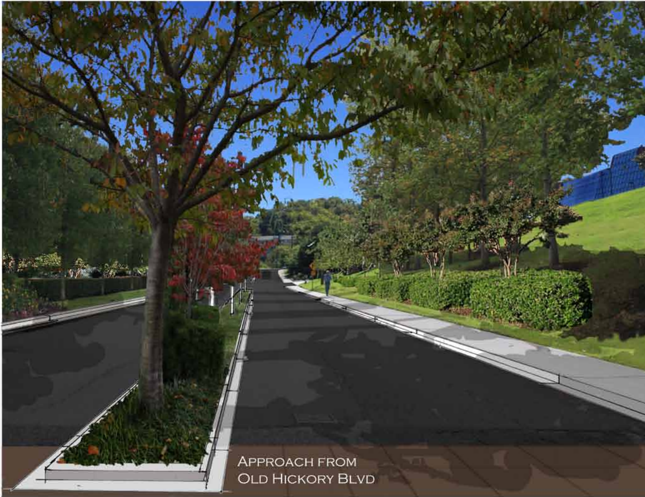
APPROACH FROM OLD HICKORY BLVD